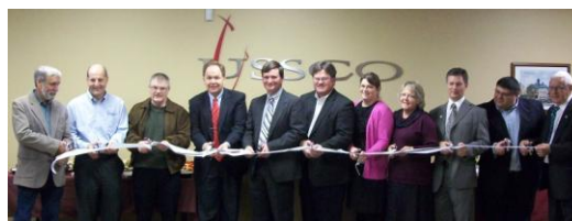
Board Members, Management Team, Contractors and the Ebensburg Office Manager participated in a Ribbon Cutting at the relocated Ebensburg Office.