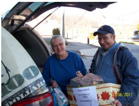
Volunteers from the Park Avenue Food Pantry unload the 250 food items and cash collected during Credit Union week in October.